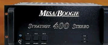
Strategy® 400 Stereo & Simul 295™

Quad & Studio Preamps revolutionized LA rack scene and intro'd tuned recording outs. Mark III. First tri-modal amp offering clean, crunch, and Boogie lead.