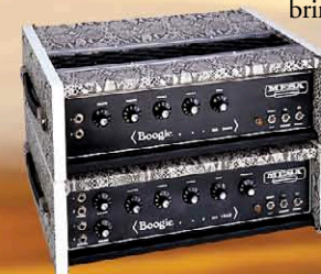
130 Bass & 130 Lead Heads

First high-power, 1x12 combo. The pioneering wolf in sheep's clothing that started it all.