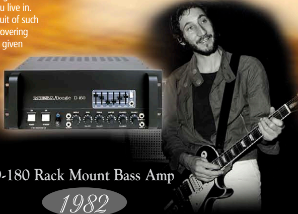
D-180 Rack Mount Bass Amp

My other gig was rebuilding old Mercedes-Benz engines in a two-story garage/studio I had built with wood trucked down directly from the saw mills. (The truck was so overloaded we had to drive five