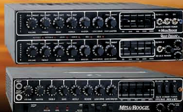
Quad™ & Studio Preamps

Keith Richards with an early Mark series combo. Over the years, the Stones have bought 42 Boogies!