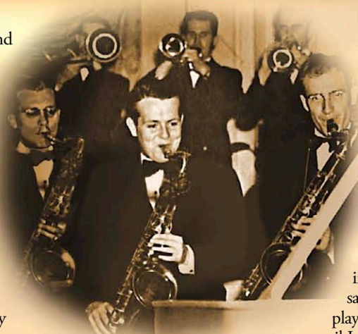
My Dad weaving his tonal magic in his Forties Dance Band.

mood as some pieces were haunting and others sunny and uplifting. I think my brain was processing music long before words began to make sense! My first experience with the mystical quality of musical instruments included the funky smell of my dad's open sax case