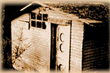
The Original Home of Tone. The Doghouse Workshop in Lagunitas. Crescent moons on door are remnants from the original Princeton baffle boards, having been cut out to hold 12" speakers.

would sustain forever. That was the beginning of high-gain cascading pre-amp architecture. This wasn't an incremental increase of 50 or even 100 percent, this was an increase of 50 times the normal gain of an amplifier and an entirely new realm of performance.