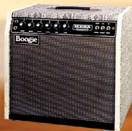
Snakeskin Mark I Boogie®