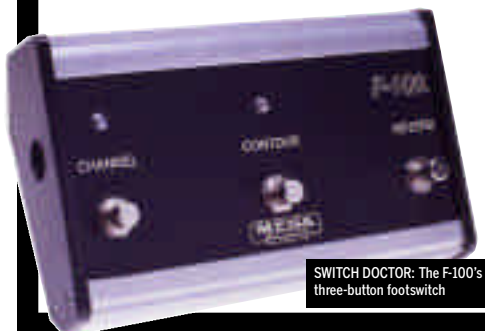
SWITCH DOCTOR: The F-100's three-button footswitch