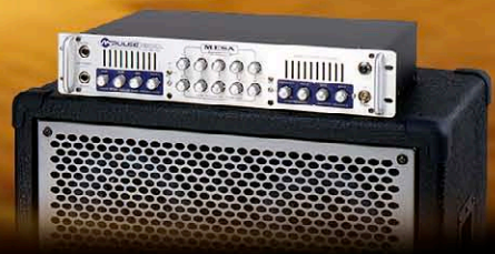
M-Pulse 600™ 2001

New tube preamp with 5 Band Parametric and full featured Compressor feeds Simul State power section.