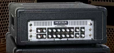
Big Block Titan™ 2006

Intuitive streamlined all-tube preamp based on the WalkAbout features a footswitchable Bass Overdrive mode and massive 750 watt Simul State power.