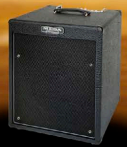
Walkabout Scout™ 2002

New tube preamp with 5 Band Parametric and full featured Compressor feeds Simul State power section.