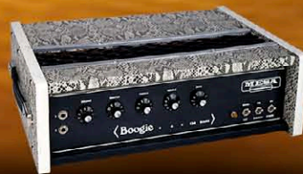
Boogie® Bass 130