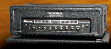
Big Block 750™ 2004

300 Watt Walkabout Scout Combo with downfiring passive radiator redefines portable Bass tone.