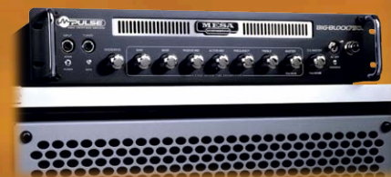
Big Block 750 rack chassis on RoadReady Cabinet

Big Block All-Tube Preamp guarantees musical warmth all the way through the tube driver stage. Power block with dual cooling fans house a battery of 12 heavy duty custom mosfets! Massive toroidal transformer produces stunning current while reducing noise.