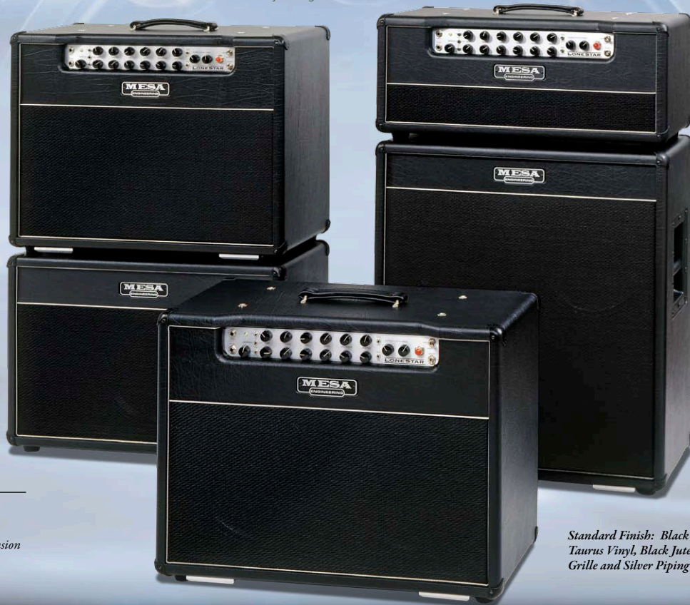
Standard Finish: Black Taurus Vinyl, Black Jute Grille and Silver Piping

"This is a well-mannered ass-kicker that blows away the competition with righteous unapologetic perfection. Angelic clean, classic inspiring over-drive, musical deep reverb and soul-melting high gain are all child's play for this Mesa. It doesn't get much better than this at any price." Guitar World Magazine