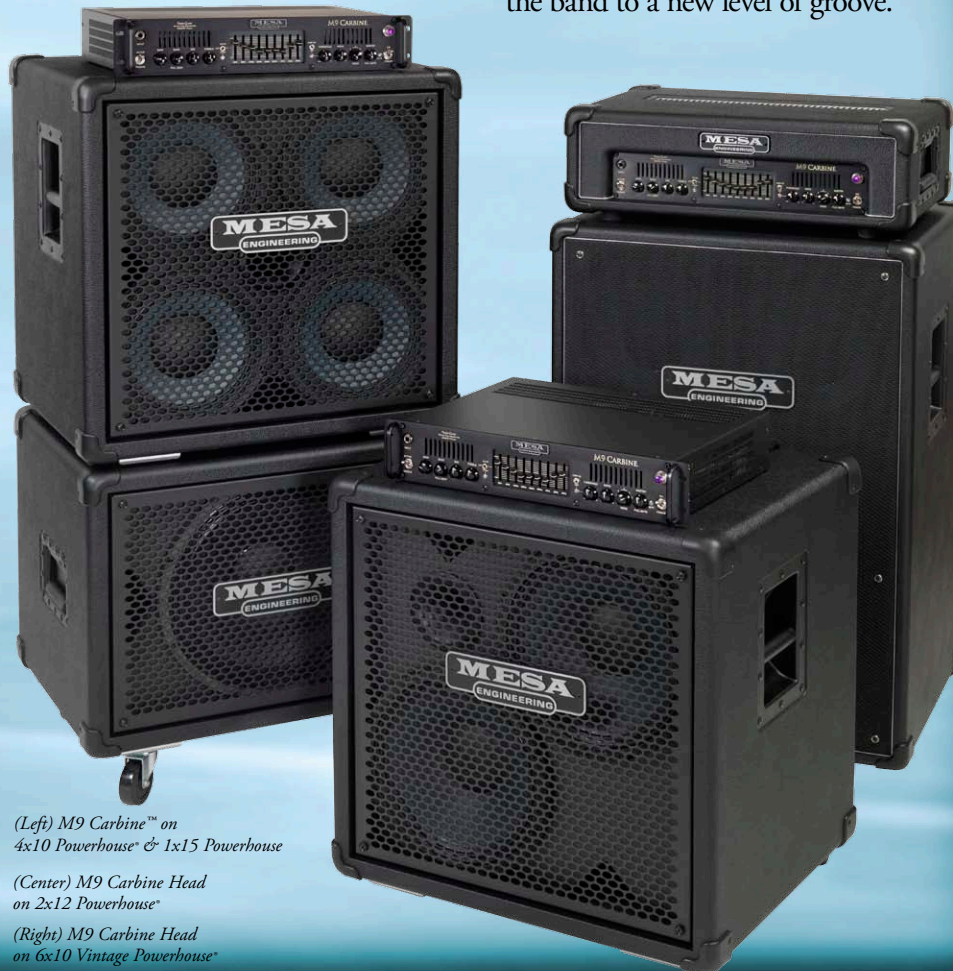
(Left) M9 Carbine™ on 4x10 Powerhouse® & 1x15 Powerhouse

feel the authority of your instrument through the new M9 Carbine. Go ahead, wield the power. Command the band to a new level of groove.