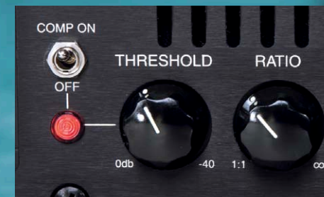
COMPRESSOR: Full-featured compressor gives you complete control of dynamics and includes THRESHOLD control for sensitivity adjustment and RATIO for gain reduction.