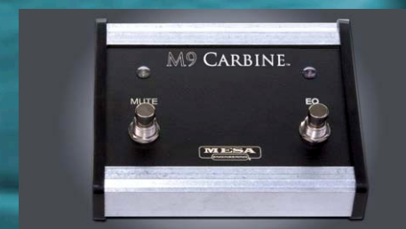
FOOTSWITCH: Live performance is enhanced with the ability to add the 9 Band Graphic on the fly giving you a second sound on command and Tuner MUTE allows silent tuning.