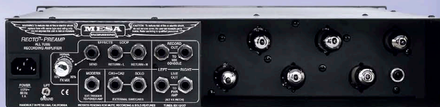
(Above) What a blend of jacks and glass. Each of the six 12AX7s contains two separate tube units, for twelve Class A triodes in all. Jack at right is additional Input for built-in rack applications.

straight in to the Recto Pre-Amp and get right to the heart of your playing—inspiration.