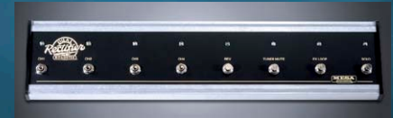
Roadster Footswitch allows instant access to channels, reverb, tuner mute, loop and solo.