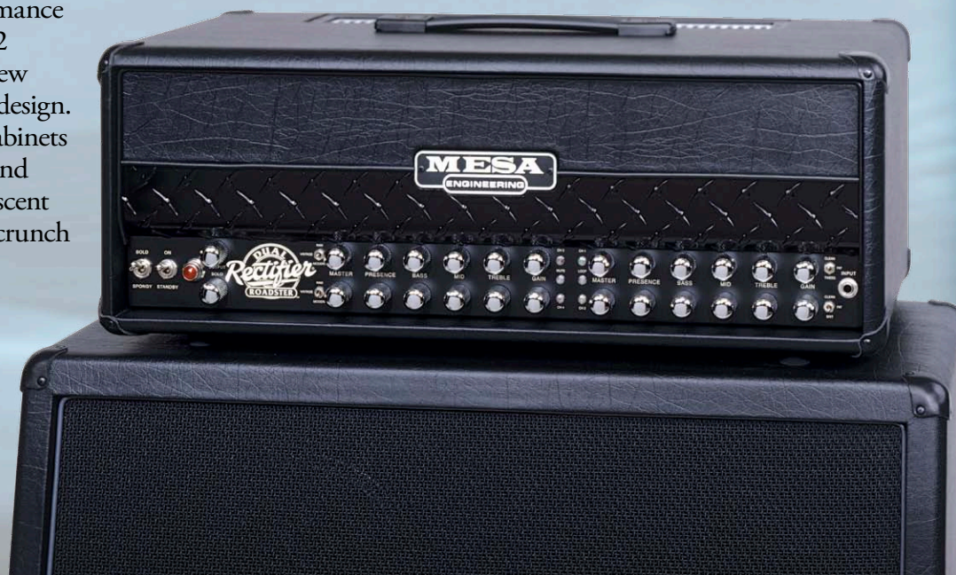
Where vintage meets hard core... Roadster Head on Rectifier 4x12