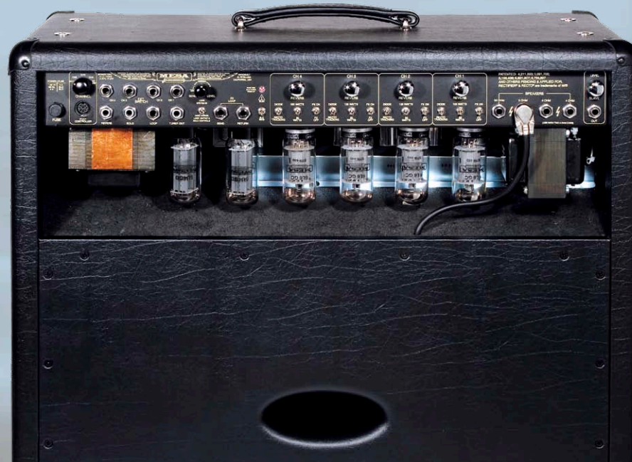
Roadster 1x12 Combo featuring ported closed-back design. Also available as 2x12 fully closed-back design.