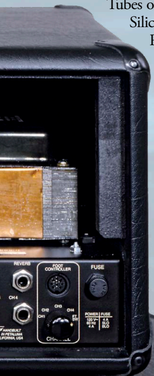
Rear panel of Roadster Head. Multi-Watt Channel-Assignable Power with Switchable Rectifiers.

So when you're looking for an exciting new ride that's easy to drive, has power to burn and can handle all the turns... check out our brand new Roadster ™ . It's the perfect addition to any guitar garage.