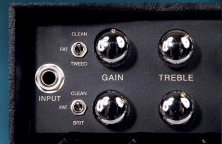
Channels 1 & 2 each offer 3 Mode choices - two of which are repeated for added flexibility when configuring your footswitching map. CLEAN and FAT modes appear in both Channels so you can set-up two very different Cleans or, clone your favorite sound and alter it slightly for clean or pushed soloing. From there, Channel 1 is home to the soulful mid gain voice of American Blues in TWEED, while Channel 2 crosses the Atlantic to crusade for classic English Rock sounds in the urgent mid gain BRIT mode.