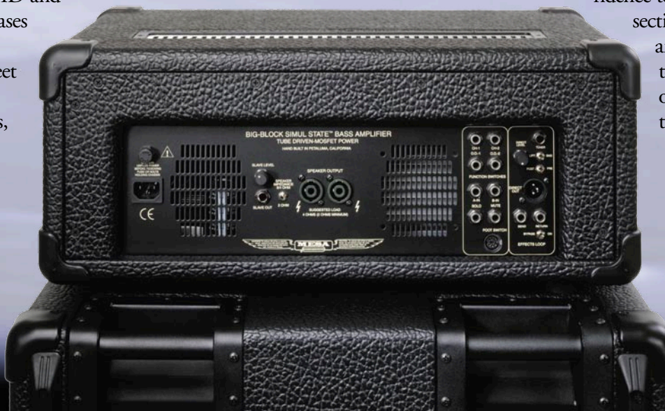
(left) Rear of Big Block Titan V-12 shown in optional standard head case on PowerHouse Cabinet

So when your gig requires coliseum capability or, if you just want the confidence to drive any rhythm section, fire up the TITAN and put that V-12 power to work for you. It's the only sound mightier than Big Block Rock.