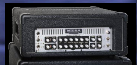
Titan V-12 in optional head case on PowerHouse 2x15 cabinet

Transparent Series Effects Loop circuitry handles all the interfacing of your outboard processing and is fully bypassable.