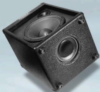
Scout's bottom-loaded passive radiator provides huge low end!

This new Bass Radiating design kicks out turbo-charged bass response that is unbelievably fat, yet defined, while providing remarkable power handling capacity, all from an exceptionally light and compact cabinet!