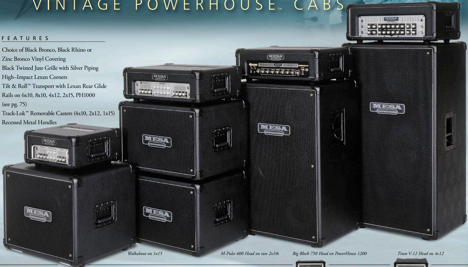
Walkabout on 1x15