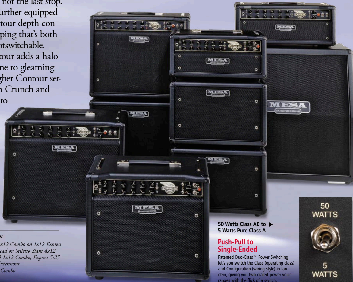
Pictured Above; Left to Right

pull like a freight train, locomotive torque. So step on up. The Express Line to Tone is now Arriving!