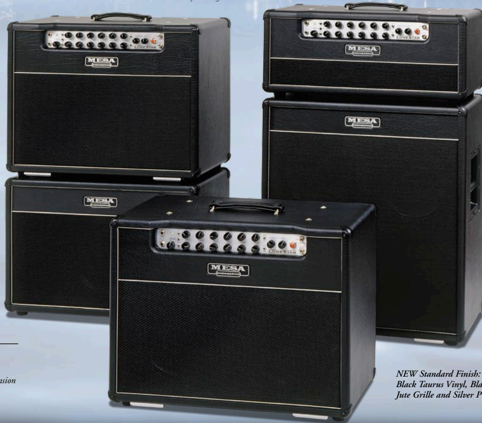
NEW Standard Finish: Black Taurus Vinyl, Black Jute Grille and Silver Piping

Multi-Watt™ Channel Assignable Power features Duo-Class™ which allows each Channel to operate in 10 watts Pure Class A, 50 & 100 watts Class AB – letting you tailor the power to the playing style each channel will be dedicated to.