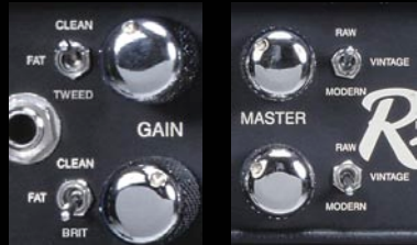
Channels 1 and 2