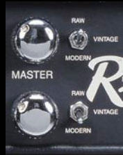
Channels 3 and 4

A La Mode... Each Channel offers 3 Mode choices. The two pairs of Channels (Rhythm 1 & 2 and Lead 3 & 4) are duplicated so you can use similar pre-amp sounds with different Power Tube, Rectifier and Wattage configurations. Channels 1 & 2 offer CLEAN, FAT & BRIT. Channels 3 & 4 provide RAW, VINTAGE & MODERN.