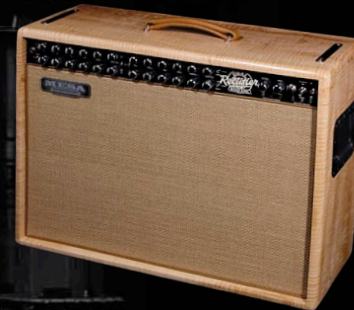
Road King 2x12 Combo with Private Reserve Flame Maple cabinet.