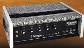
Boogie® Bass 130