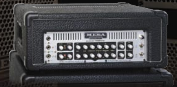
Big Block Titan™

Intuitive streamlined all-tube preamp based on the WalkAbout features a footswitchable Bass Overdrive mode and massive 750 watt Simul State power.