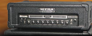
Big Block 750™

300 Watt Walkabout Scout Combo with downfiring passive radiator redefines portable Bass tone.