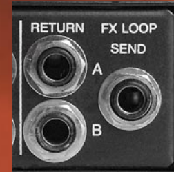
Programmable FX Loop with stereo Returns.

work much like an old style knob... all parameters are displayed and active all the time. To you, that means no scrolling to find your Treble on the gig. You don't have to wonder how your Bass and Mid are set, you can see them from across the stage.