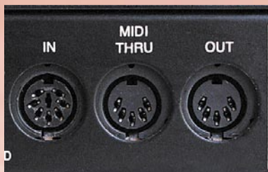
Full midi, including phantom power & data dump.