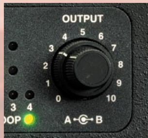
Manual Output eliminates the need to rewrite presets for different venues.

IS an arsenal of the most powerful guitar tones available in the world today...and that's without using the Continuous Control function. But don't believe us, just listen to the likes of John Petrucci,