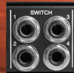
Four Function Switches control outboard gear.