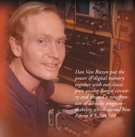
Dan Van Riezen put the power of digital memory together with our classic pure analog Boogie circuitry and created a new frontier of all-tube programmability which earned him Patent # 5,208,548