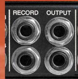
Stereo Main and Recording Outputs.