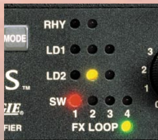
Toggle through eight different preamp circuits!

TRIAXIS™...Total access to the encyclopedia of TONE. Digital disbelievers scoffed at the very idea of packing five 12AX7's and 25 years of tube tone heritage into one rack space of pure magic...but there they are...five little tone bottles, glowing quietly-all too ready to rock the house.